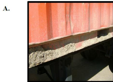
Undercarriage soil (A) and seeds (B):